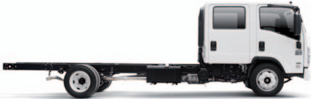
NQR 450 Crew