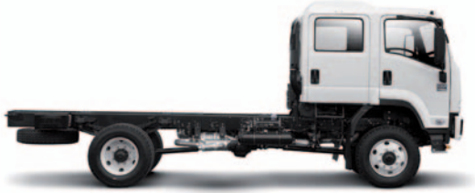
FTS 800 Crew