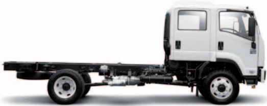
FSS 550 Crew