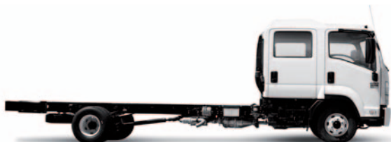
FRR 600 Crew